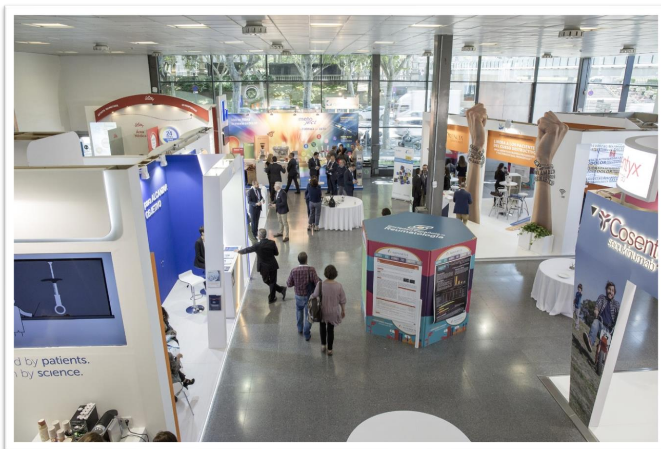
The exhibition area at the conference venue

All catering and the welcome reception will take place in the exhibition area located on ground floor to ensure a good flow. The exhibition area has natural daylight and high ceiling.